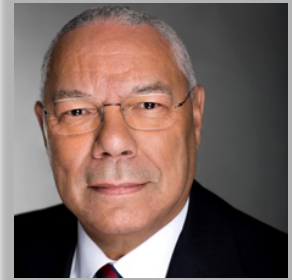
GENERAL COLIN POWELL